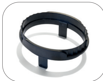
Oval Glove Ring: 60261 (2 pcs)