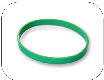
Oval Spanner Ring (green): 60264 (2 pcs) For thin gloves/seals