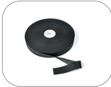
Tape: 61373 (1 meter)