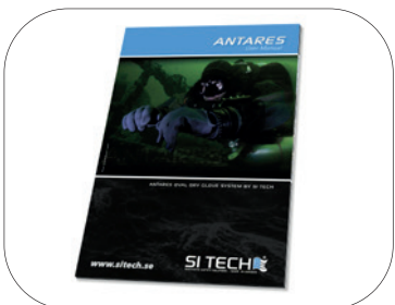
User Manual (1 pc)