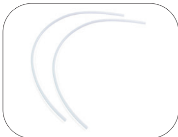
Pressure Equalization Tubes: 60233 (2 pcs)