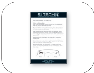
A note regarding TPE seals: 87532 (1 pc)