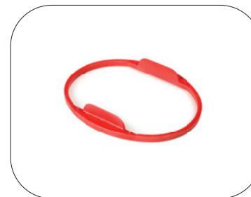
ANTARES Support Ring: 60266 (2 pcs)