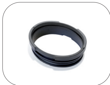
ANTARES Oval Stiff Ring: 60260 (2 pcs)