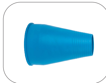
Elastoseals, Standard size: 61710-BLUE (2 pcs)