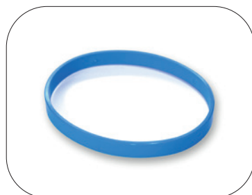
Oval Spanner Ring (blue): 60263 (2 pcs) For medium/thick gloves/seals