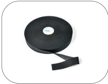
Tape: 61373 (1 meter)