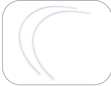
Pressure Equalization Tubes: 60233 (2 pcs)