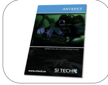
User Manual (1 pc)