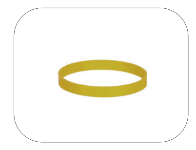
Spanner Rings, yellow: 60214 (2 pcs) For thick gloves/seals