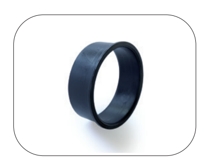
Quick Clamp Docking Rings: 60931 (2 pcs)