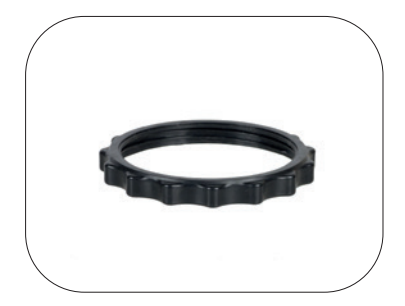
Release Rings: 60232 (2 pcs)