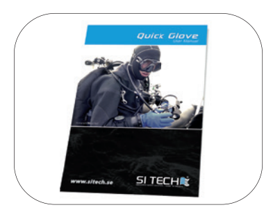
User Manual: 87519 (1 pc)