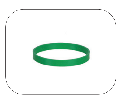
Spanner Rings, green: 60219 (2 pcs) For ultra thin gloves/seals