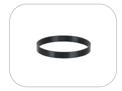
Spanner Rings, black: 60211 (2 pcs) For extremely thick gloves/seals