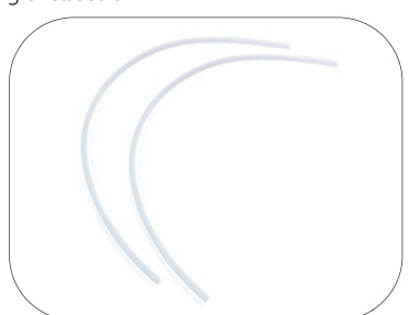
Pressure Equalization Tubes: 60233 (2 pcs)