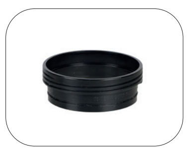
Connecting Rings: 60231 (2 pcs)