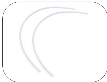
Pressure Equalization Tubes: 60233 (2 pcs)