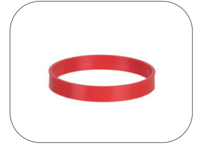
Spanner Rings, red: 60538 (2 pcs) For ultra thin gloves/seals