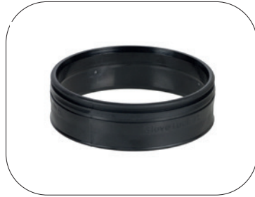
Glove Rings: 60529 (2 pcs)