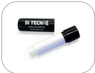
Lube Stick: 60540 (1 pc)