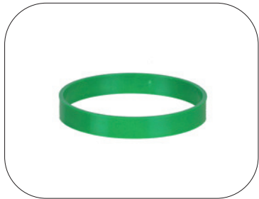
Spanner Rings, green: 60537 (4 pcs) For thin gloves/seals