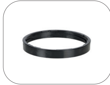
Locking Rings: 60527 (2 pcs)