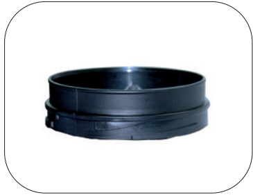
Suit Rings: 60523 (2 pcs)