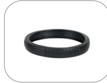
Rubber Rings: 60526 (2 pcs)