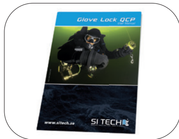
User Manual: 87517 (1 pc)