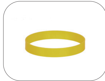
Spanner Rings, yellow: 60535 (2 pcs) For extremely thick gloves/seals