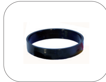
Spanner Rings, black: 60524 (2 pcs) For use together with wrist ring 60420