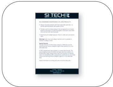
A note regarding TPE seals: 87532 (1 pc)