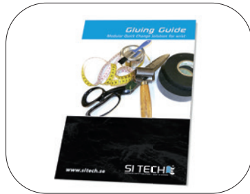
Gluing Manual: 87520 (1 pc)