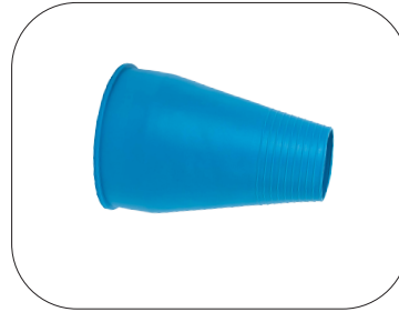
Elastoseals, Standard size: 61710-BLUE (2 pcs)