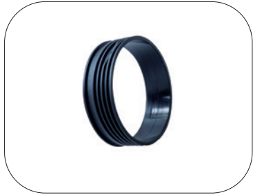
Stiff Rings: 60200 (2 pcs)