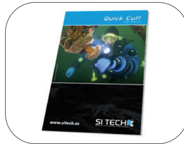
User Manual: 87513 (1 pc)