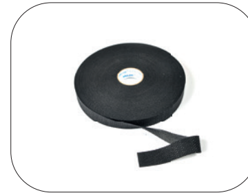
Tape: 61373 (1 meter)