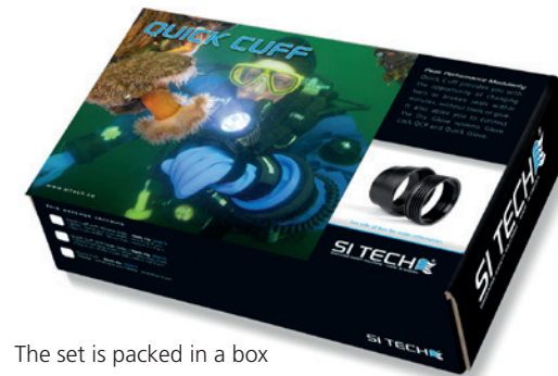
The set is packed in a box