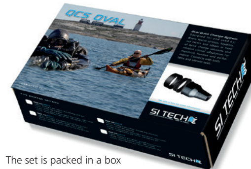
The set is packed in a box