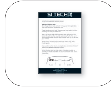
A note regarding TPE seals: 87532 (1 pc)