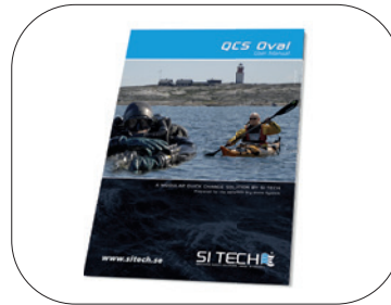
User Manual: 87510 (1 pc)