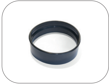
PU-Rings: 60251 (2 pcs)