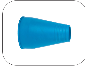
Elastoseals, standard size: 61710-BLUE (2 pcs)