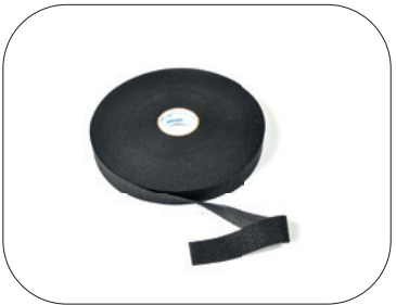
Tape: 61373 (1 meter)