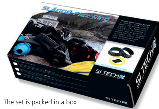
The set is packed in a box