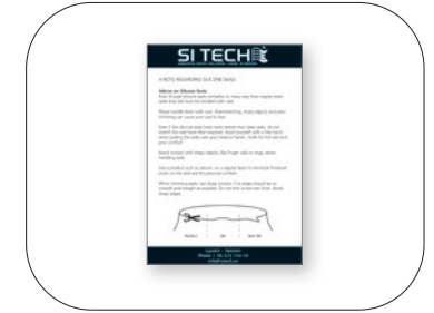
A note regarding silicone seals: 87530 (1 pc)