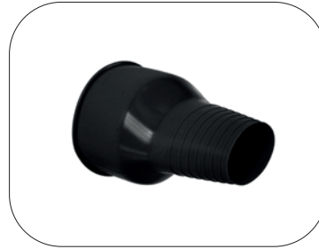
Silicone Seals, standard size: 61025 (2 pcs)