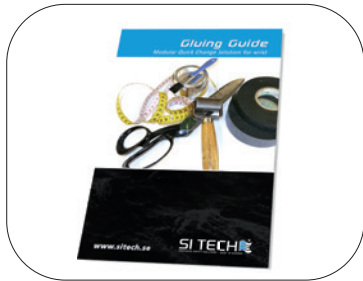
Gluing Manual: 87520 (1 pc)