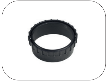
SLÄGGÖ Flex Ring, large: 60710 (2 pcs)