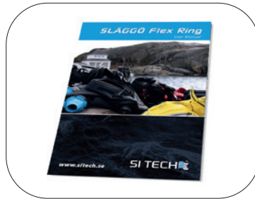
User Manual: 87524 (1 pc)