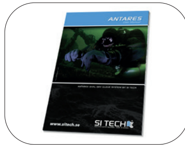
User Manual (1 pc)