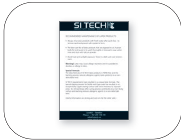
A note regarding latex seals: 87531 (1 pc)