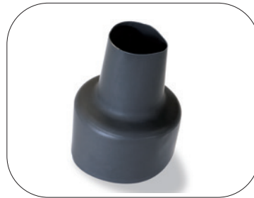
Latex Wrist Seals: 61062 (2 pcs)