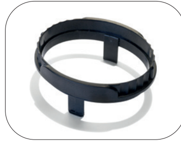
Oval Glove Ring: 60261 (2 pcs)