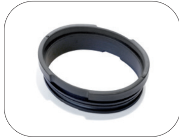
ANTARES Oval Stiff Ring: 60260 (2 pcs)