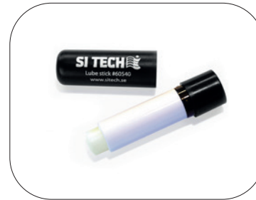
Lube Stick: 60540 (2 pcs)