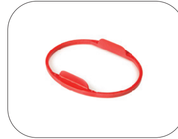
ANTARES Support Ring: 60266 (2 pcs)