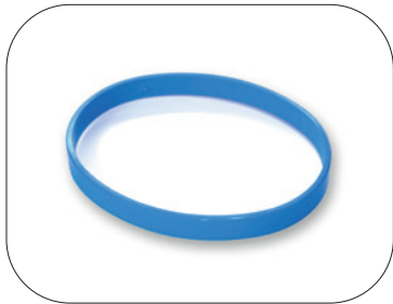
Oval Spanner Ring (blue): 60263 (2 pcs) For medium/thick gloves/seals