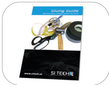
Gluing guide: 87522 (1 pc)