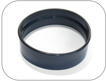
PU-Ring: 60251 (2 pcs)