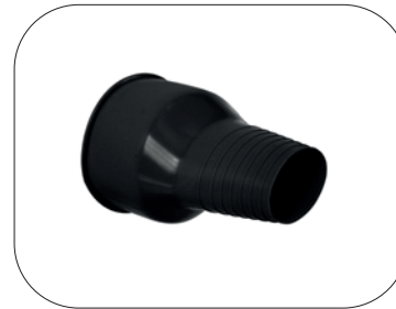
Silicone Wrist Seals: 61025 (2 pcs)