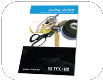
Gluing guide: 87522 (1 pc)