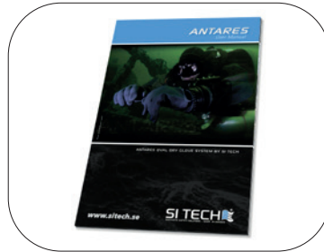
User Manual (1 pc)