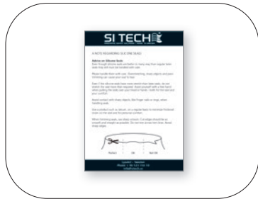
A note regarding silicone seals: 87530 (1 pc)