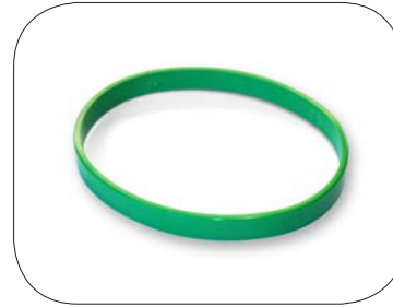
Oval Spanner Ring (green): 60264 2 pcs