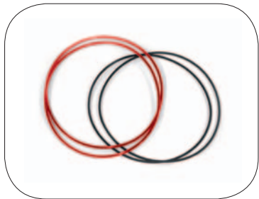
O-rings: - 4 pcs of 1,5 mm, Item no. 80173 (mounted+ spares) - 4 pcs of 1,6 mm, Item no. 82038 (mounted+ spares)