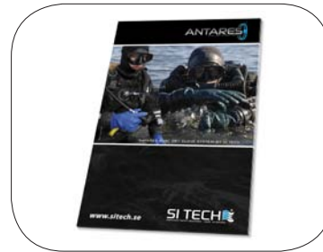
User Manual 1 pcs