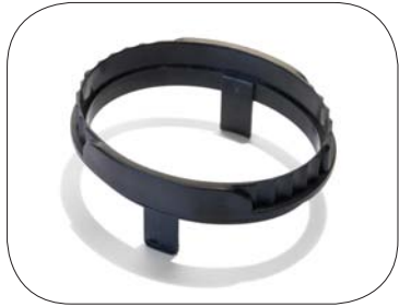
Oval Glove Ring: 60261 2 pcs