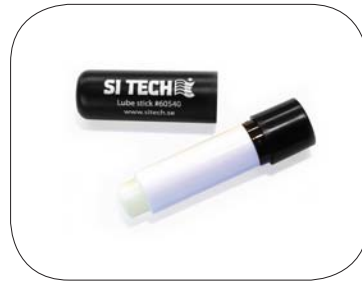
Lube Stick: 60540 2 pcs