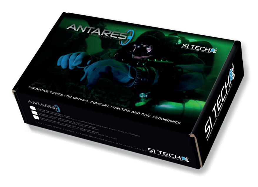
SI TECH 🛍