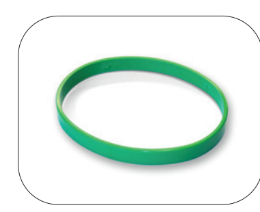
Oval Spanner Ring (green): 60264 (2 pcs) For thin gloves/seals