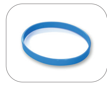
Oval Spanner Ring (blue): 60263 (2 pcs) For medium/thick gloves/seals