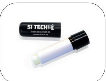
Lube Stick: 60540 (2 pcs)