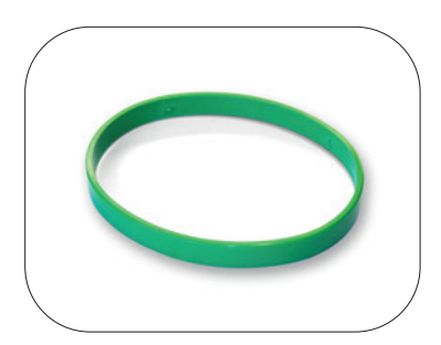
Oval Spanner Ring (green): 60264 (2 pcs) For thin gloves/seals