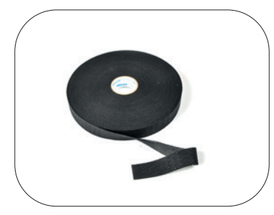
Tape: 61373 (1 meter)