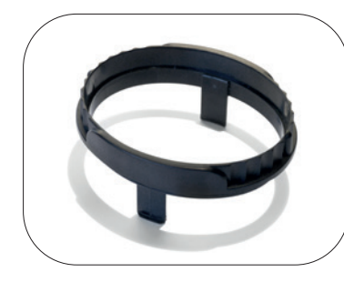
Oval Glove Ring: 60261 (2 pcs)