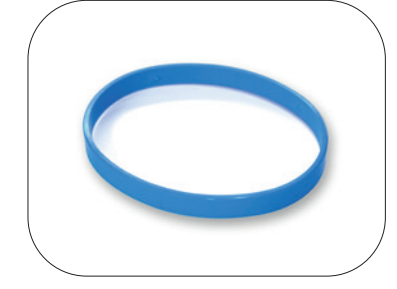
Oval Spanner Ring (blue): 60263 (2 pcs) For medium/thick gloves/seals