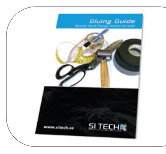
Gluing guide: 87522 (1 pc)