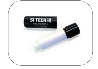
Lube Stick: 60540 (2 pcs)