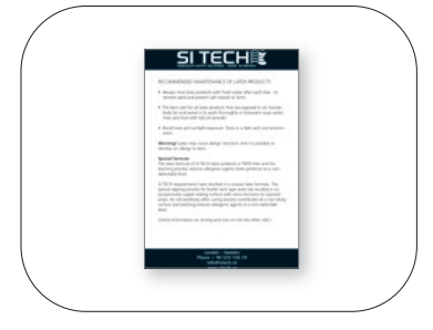
A note regarding latex seals: 87531 (1 pc)