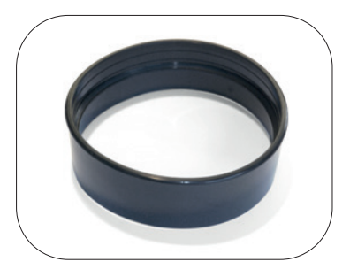
PU- Ring: 60251 (2 pcs)

Complete ANTARES Dry Glove System with Latex seals - Item no: 60602