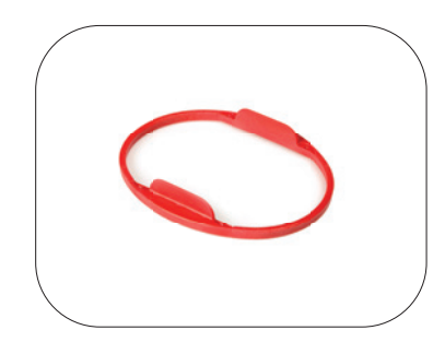
ANTARES Support Ring: 60266 (2 pcs)