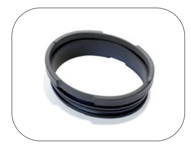
ANTARES Oval Stiff Ring: 60260 (2 pcs)