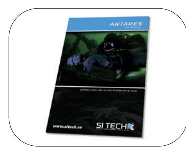
User Manual (1 pc)