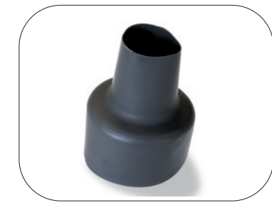
Latex Wrist Seals: 61062 (2 pcs)